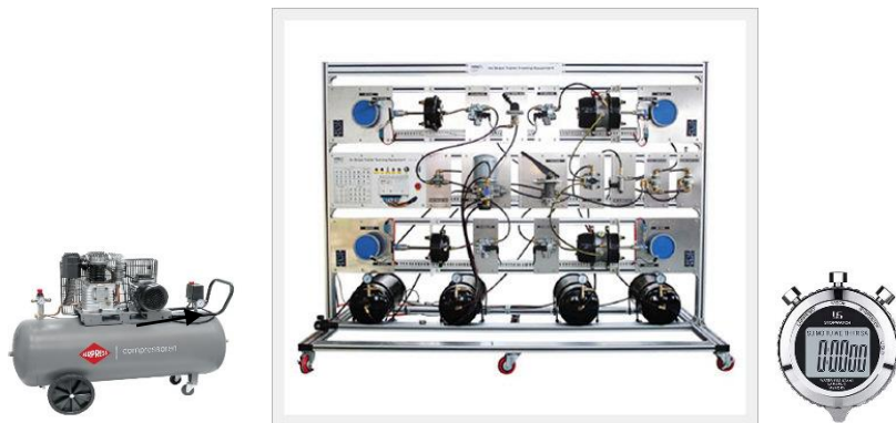
Figure 1 Equipment Setting

The distribution of braking power from the foot pedal to the wheel cylinder for vehicle brakes is through the housing. This housing is in direct contact with the two cylinders. Distribution of power through the valve. Moreover, if the use of ABS brakes, the distribution is also regulated by electronics. In this study, the control variable is the ABS electronic system. where the ECU input power is 24 (volts) and braking resistance is 36 (ohms), for the left and right wheels, Tool specifications: